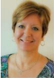
Leslie Carr College of the Canyons